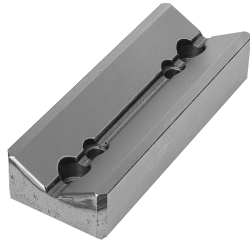
SNG98 (U Block)