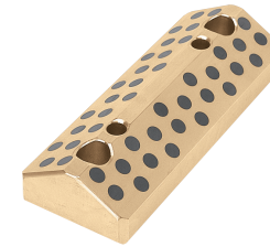
SNG97 (V Block)